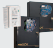
Kantech Door Controller Family