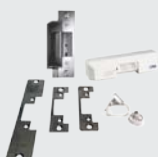
DK-1 Door Hardware Kit